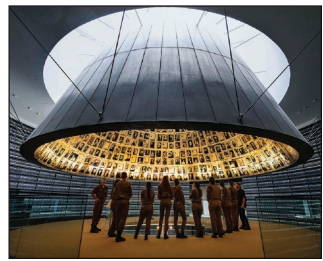
A group of Israeli soldiers look at pictures of Jews killed during the Holocaust in the Hall of Names of the Yad Vashem Holocaust Memorial on Sunday in Jerusalem. The annual Israeli memorial day for the 6 million Jews killed in the Holocaust of World War II begins at sundown today. More photos at arkansasonline.com/417memorial/.