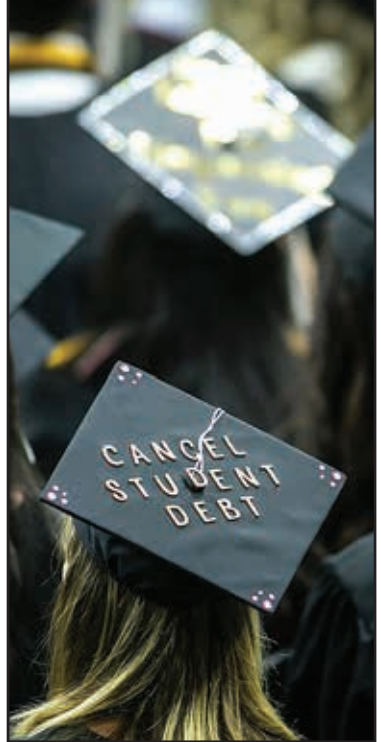
The cap of a University of Iowa graduation candidate reads "Cancel student debt" during a commencement ceremony for the College of Liberal Arts and Sciences in May 2022 in

Iowa City, Iowa.